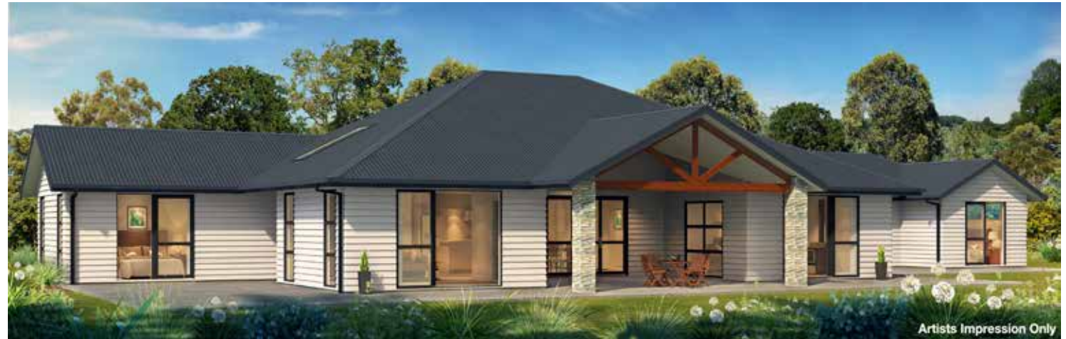
Artists Impression Only